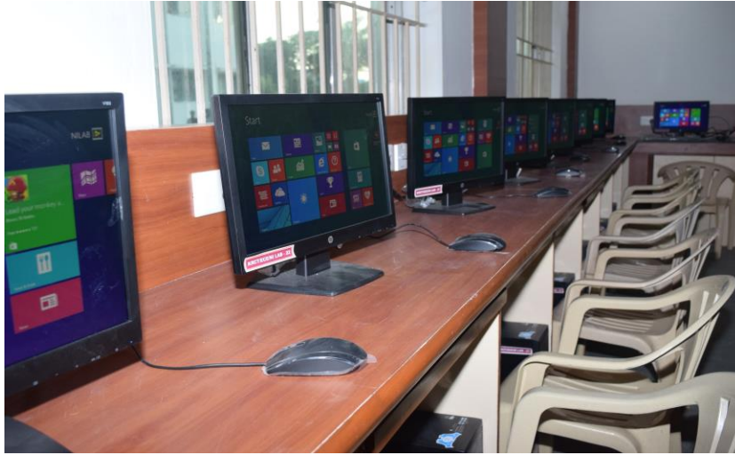
Snapshot of National Instruments laboratory